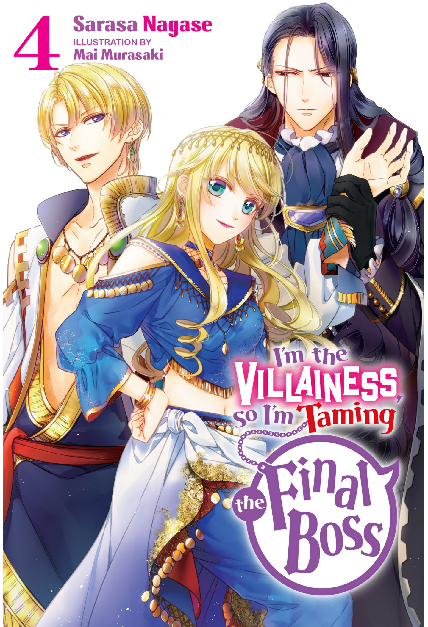
ILLUSTRATION BY Mai Murasaki